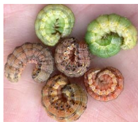
Figure 1: Different color patterns of corn earworm larvae

Overall, larva varies in color, body is green, brown, pink or occasionally yellow otherwise generally black, head has a propensity to be light brown or orange by a white net-like outline and thoracic plates are black. Usually, larva laterally holds a wide dark strip over the spiracles and a white to light yellow strip under the spiracles. A couple of thin dusky strips occurs often along the middle of the back and body bears numerous black thorn-like microspines (Figure 1). The occurrence of light-colored head and spines help to differentiate corn earworm from European corn borer Ostrinia nubilalis (Hubner) and fall armyworm Spodoptera frugiperda (Smith). Both these later commonly corn infesting species, have dark heads and lack the spines. A closely related species, tobacco budworm Heliothis virescens (Fabricius), has the late instar larvae, which bear microspines also. Larvae of tobacco budworm have spines on tubercles of first, second and eighth abdominal segments that are around half the height of tubercles, however in corn earworm spines are equal to one-fourth the height of tubercle (Storer et al., 2001).